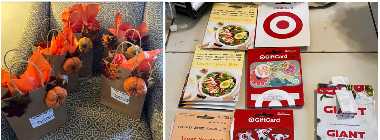
Thanksgiving Gift Cards that were collected in November.