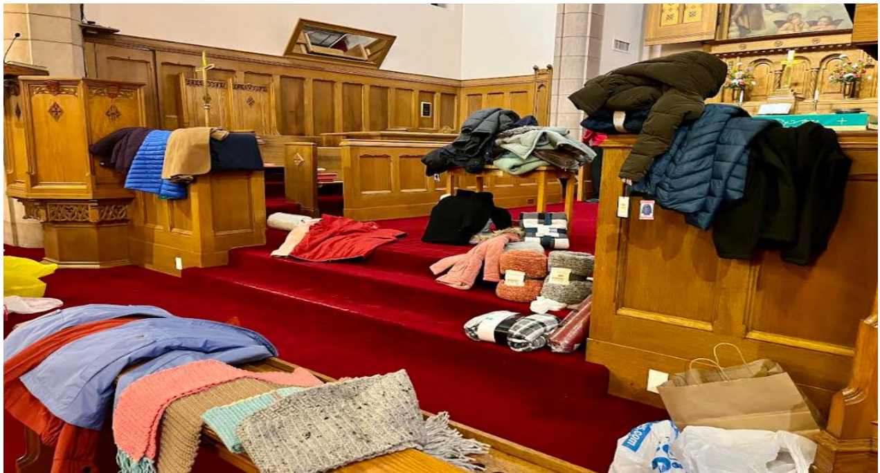
Coats and blankets on display ready to be blessed and taken to the center.