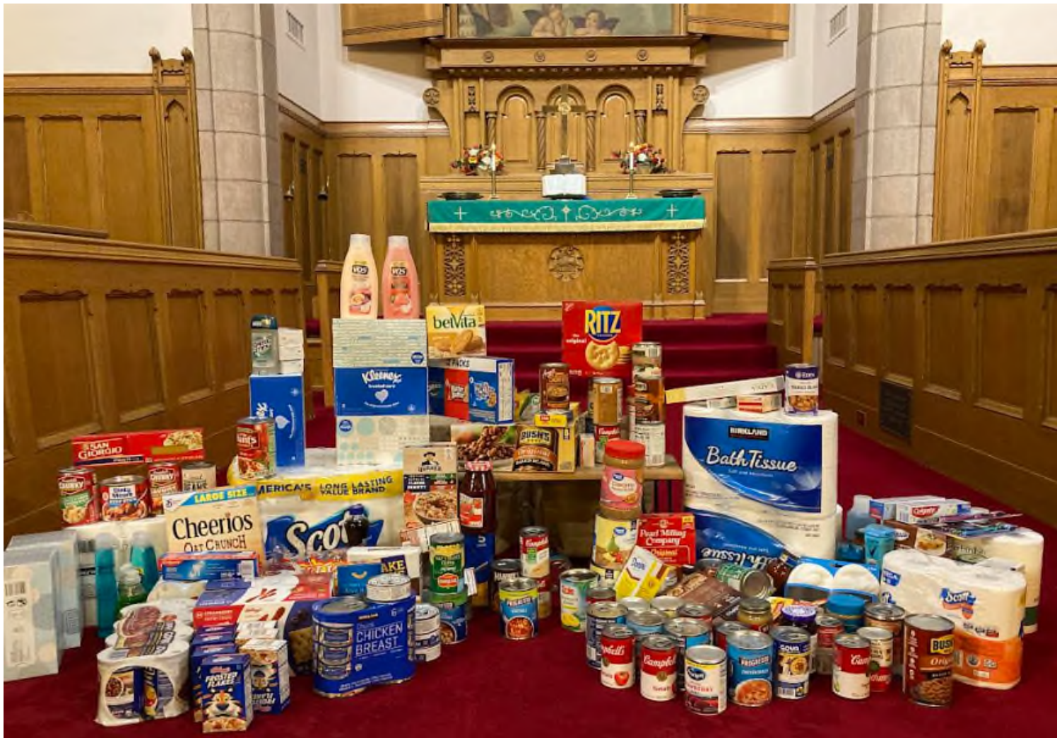
Items donated for Souper Bowl Sunday that were given to the Upper Darby Food Cupboard.